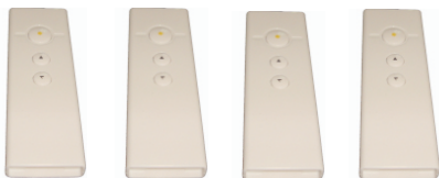
Wireless calling button to reduce unnecessary installation charges

SQ01 Standing Queue System is designed for businesses with space restrictions and fast customer turn over. SQ01 is a LCD based Standing Queue System whereby it allows business owners to show the queue and also display their in-house advertisements or TV channels.